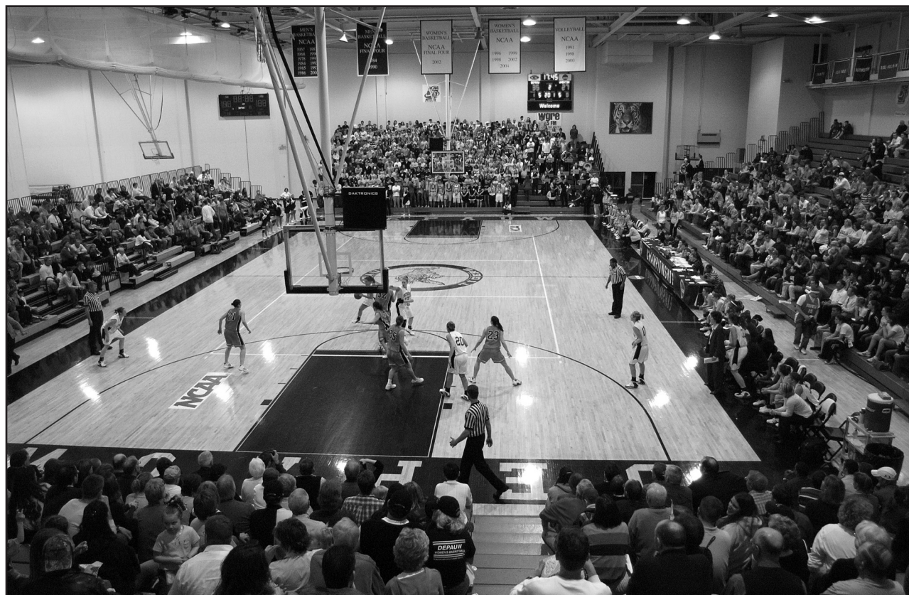
The Lilly Center has played host to NCAA tournament games in eight of the last 11 years including round of 16 and quarterfinal contests in 2006 as pictured above.